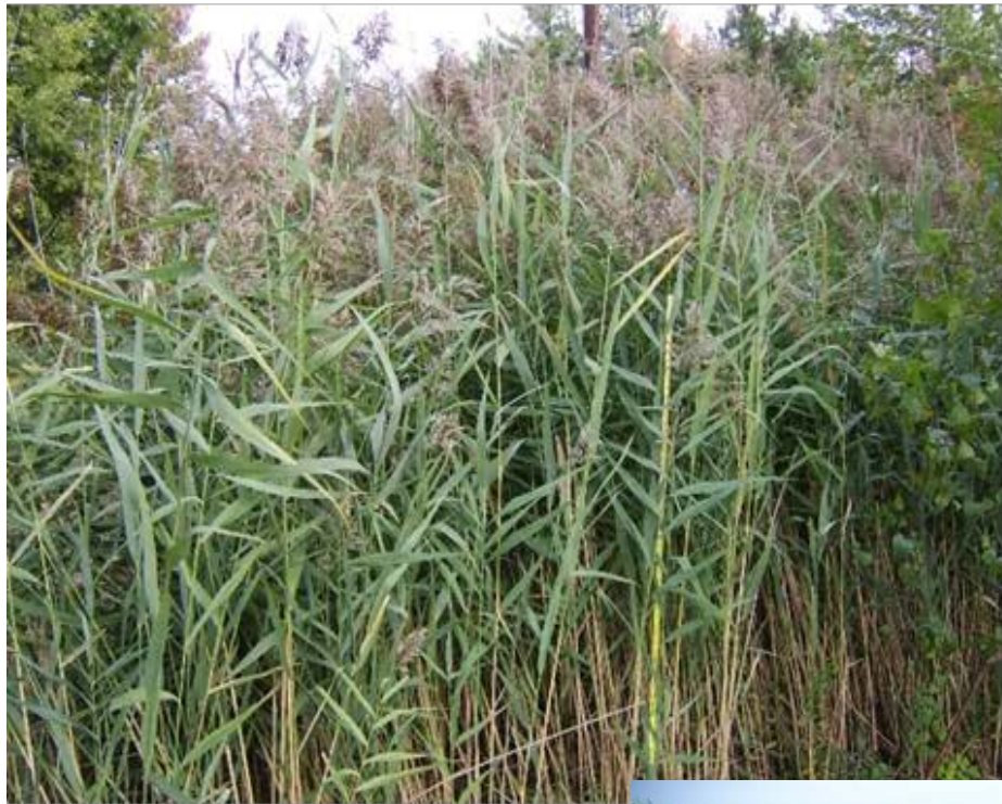
Impediments to salt marsh migration